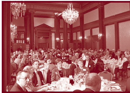
THE BALLROOM AT LONGWOOD WAS AGAIN THE SETTING FOR THE LITERACY HEROES BREAKFAST